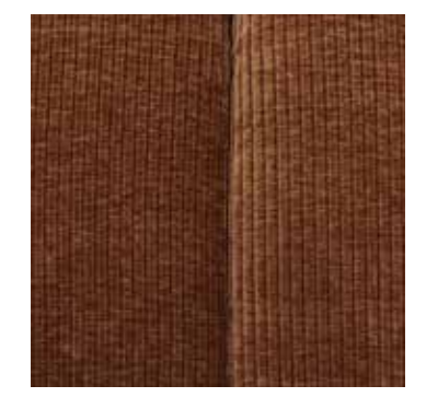
Woven rib fabric rust brown