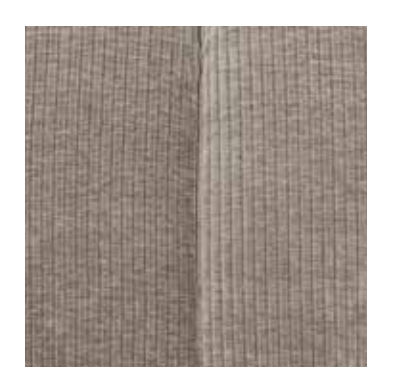
Woven rib fabric dark sand