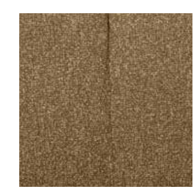
Bouclé yellow brown melange