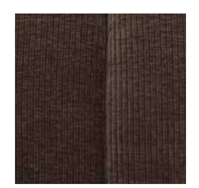
Woven rib fabric brown