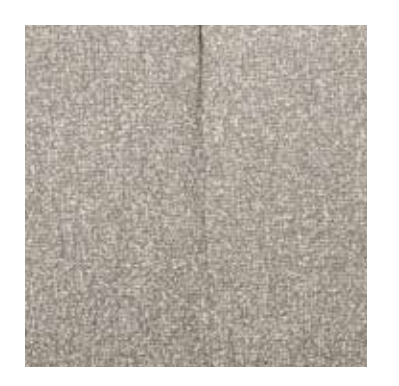
Bouclé beige melange