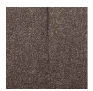
Bouclé brown melange