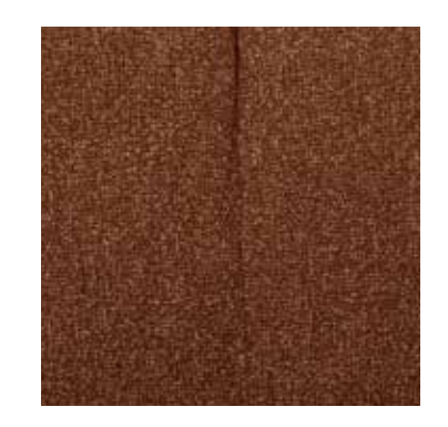
Bouclé rust brown melange