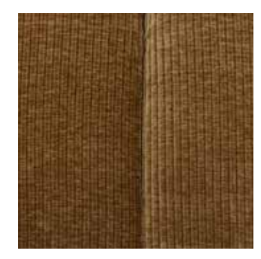
Woven rib fabric honey yellow