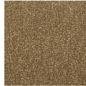
Bouclé yellow/brown melange