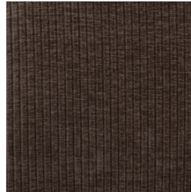
Rib fabric brown