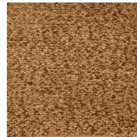
Woolly honey yellow