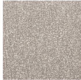
Bouclé beige melange