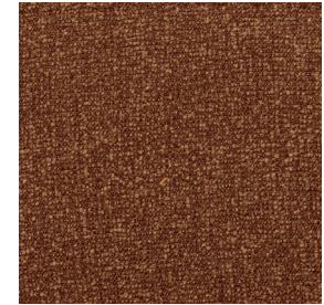
Bouclé rust brown melange