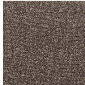
Bouclé brown melange