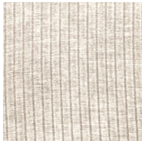
Rib fabric ecru