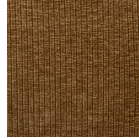
Rib fabric honey yellow