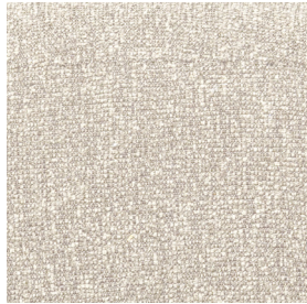
Bouclé ecru melange