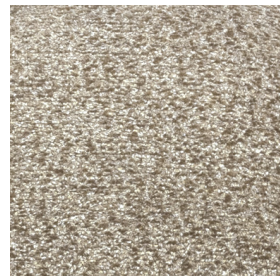
Woolly dark sand