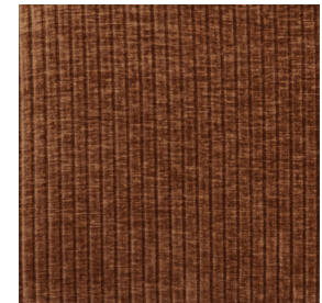
Rib fabric rust brown