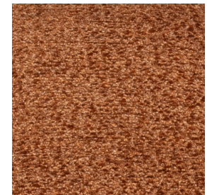
Woolly rust brown