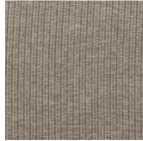
Rib fabric dark sand